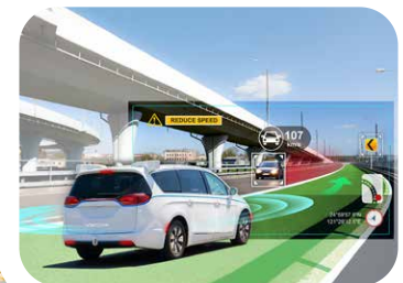
▲ In-Vehicle Computing