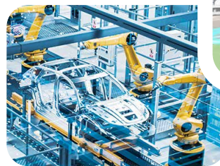
▼ Real-time AOI